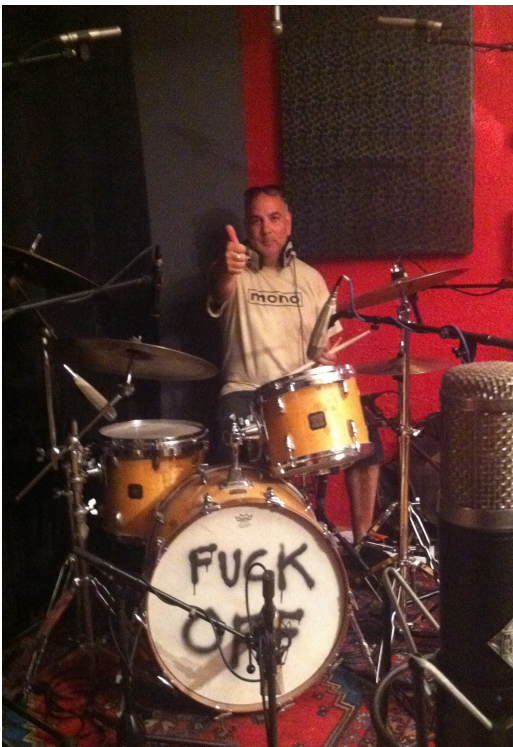
Neil today