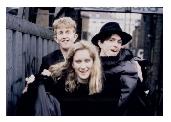
Prefab Sprout – stood next to a skip load of old ex-drummers