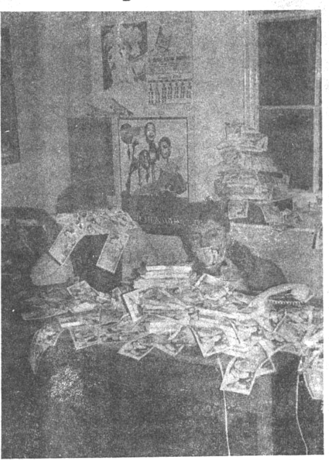
Counting money - a never ending job for Kitchenware Records

Ten and twenty pound notes littered the floor, and bundles of cash were piled high in every corner. The door to an adjacent rehearsal room was blocked from the inside - by what felt like large sacks of cash.